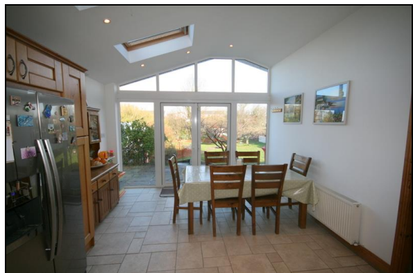
Kitchen / Dining Room

Utility Room: 4.00 x 2.00 built-in units, integrated "Whirlpool" micro-wave, plumbed for washing machine and dryer, w.c. & w.h.b.