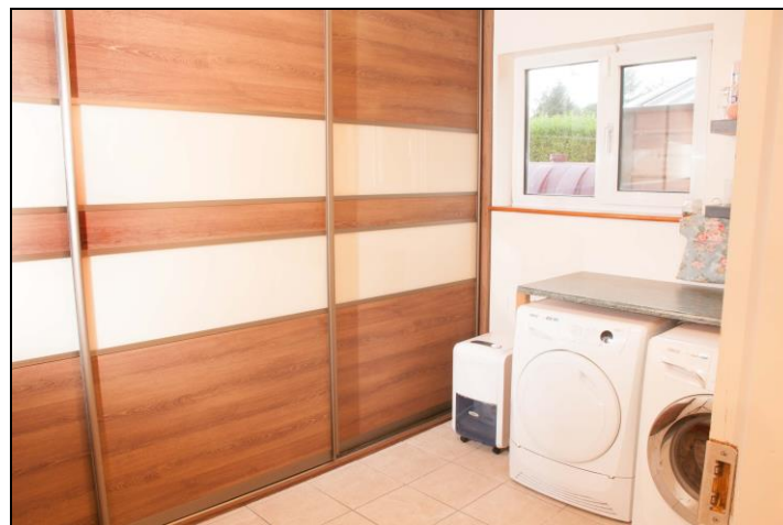
Utility : 3.3 x 2.5 tiled floor, plumbed for washing machine, wall to wall built-in presses.