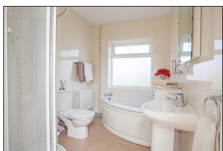
Bedroom 2: 3.7 x 3.6 with superb views. En-Suite : 3.2 x 0.9 fully tiled, w.c. & w.h.b with "Triton" pumped shower.