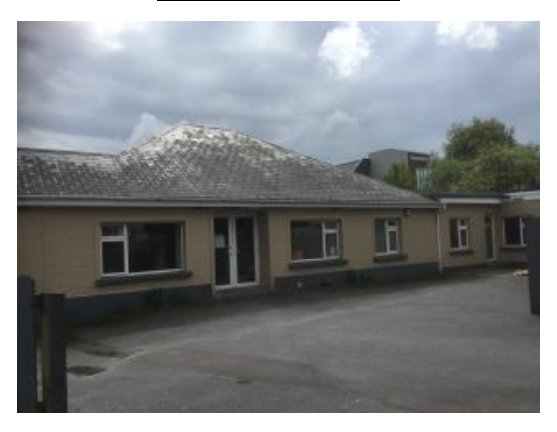
GROUND FLOOR c. 251 Sq M (c. 2700 Sq Ft)