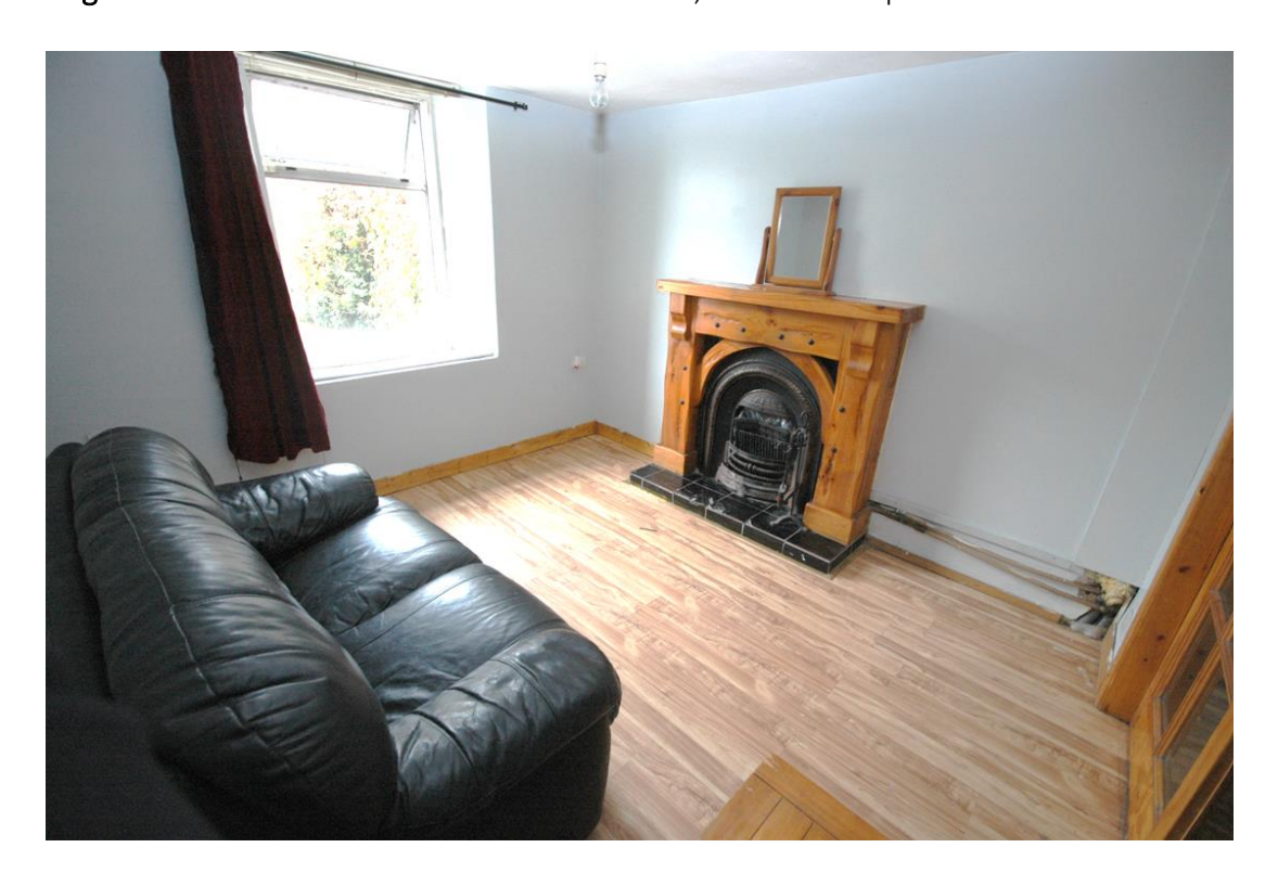
Dining Room: 4.2m x 3.2m Laminate wood floors.

Living Room: 3.3m x 3.1m. Laminate wood floors, cast iron fireplace with wood surround.