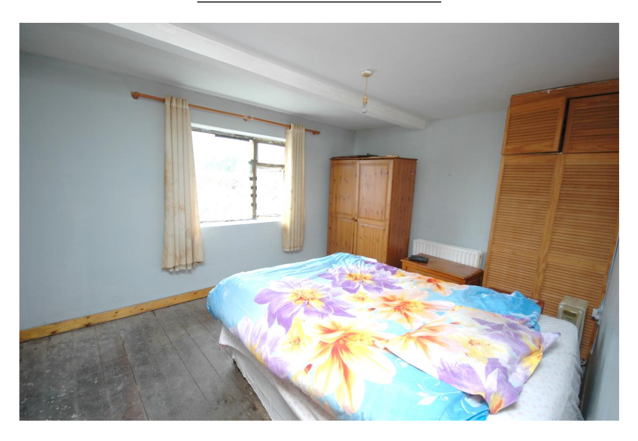
Bedroom 2: 3.45m x 3.2m. Carpet.