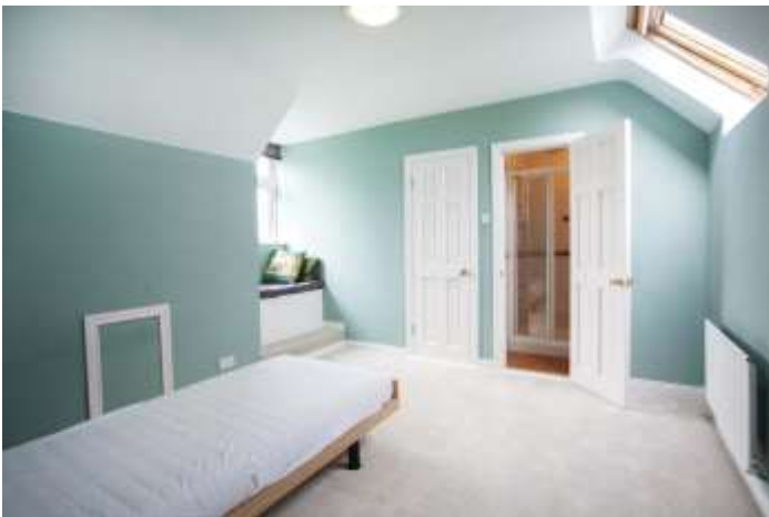
Bedroom 1: 5.0 x 3.3 including walk in wardrobe & En-Suite, fully tiled with electric "Triton" shower, w.c. & w.h.b.