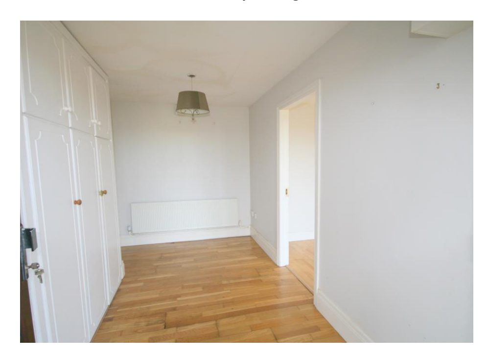
Living Room: 4.2 x 3.3 front aspect, built-in units, timber floor.