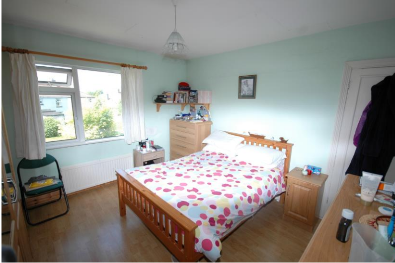
Bedroom 1: 3.90m x 3.75m wood flooring, built in wardrobes.