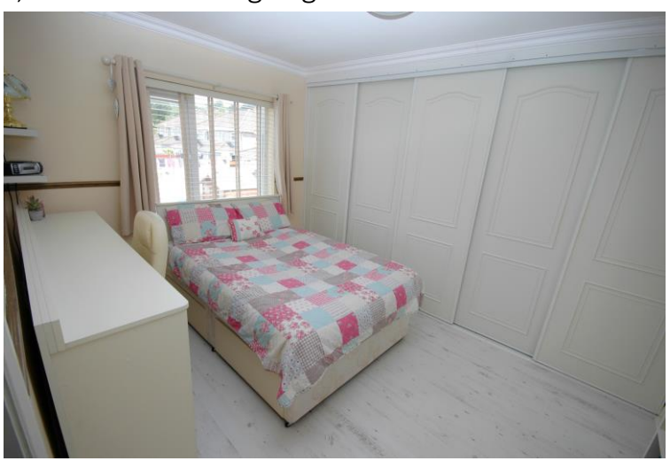
<u>Bedroom 2:</u> 3.70m x 3.10m Oak flooring, built in sliding wardrobe & blinds.