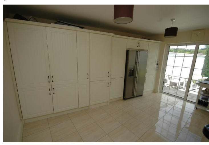
<u>Utility:</u> Tiled floors, extensive built in units & patio doors.