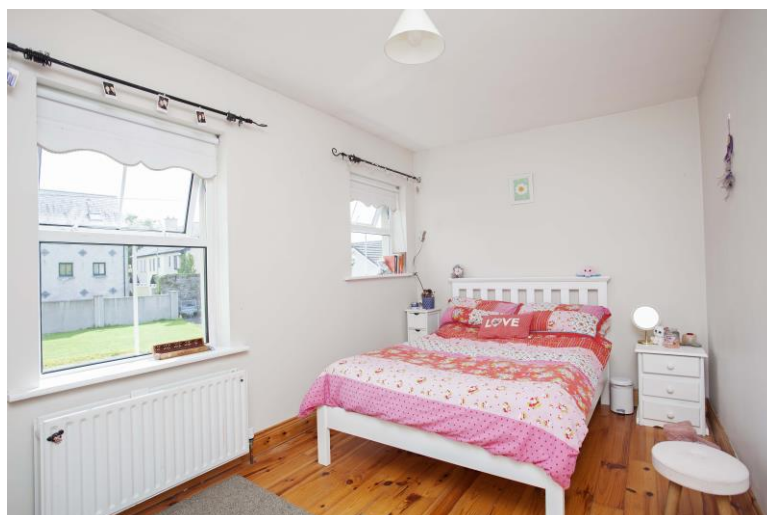
Bedroom 4: 3.7 x 3.5