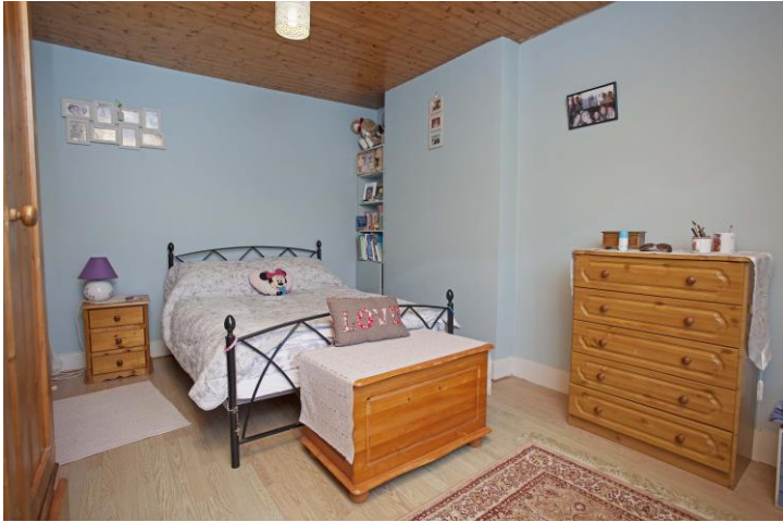
Bedroom 2: 4.4 x 2.5