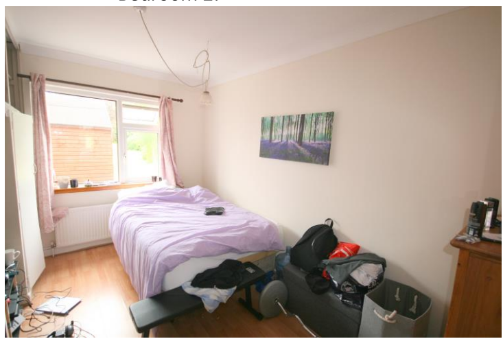
Bedroom 2: 4.1 x 3.5