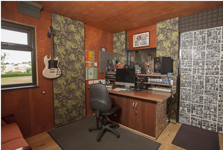
Converted Site Container: 5.8 x 2.6 insulated & wired.