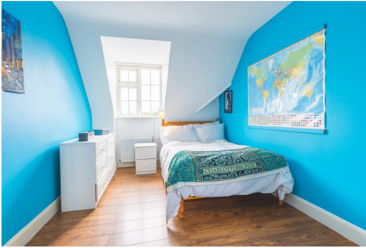
Bedroom 3: 4.4 x 2.7