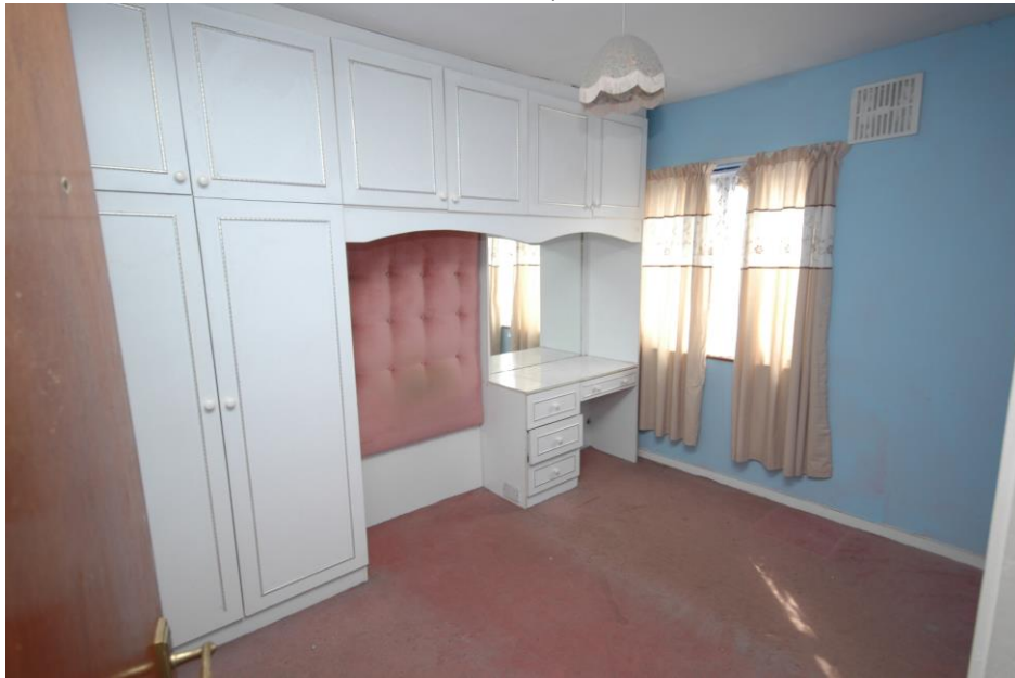
Bedroom 2: 2.3 x 3.7 with carpet & built-in wardrobe.