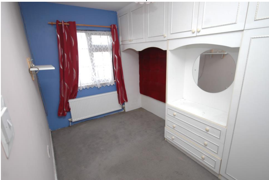
Bedroom 3: 2.9 x 2.25 with carpet.