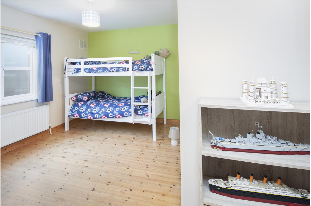
Bedroom 3: 2.9 x 2.5 front aspect, Red Deal flooring.