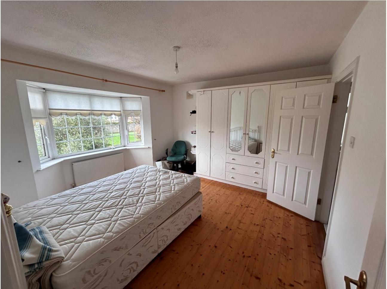
Bedroom 2: 3.8 x 3.3

Bedroom 1: 4.1 x 3.8 bay window, built in wardrobes En suite: 2.9 x 1.0 fully tiled with electric "Mira" shower, WC+WHB