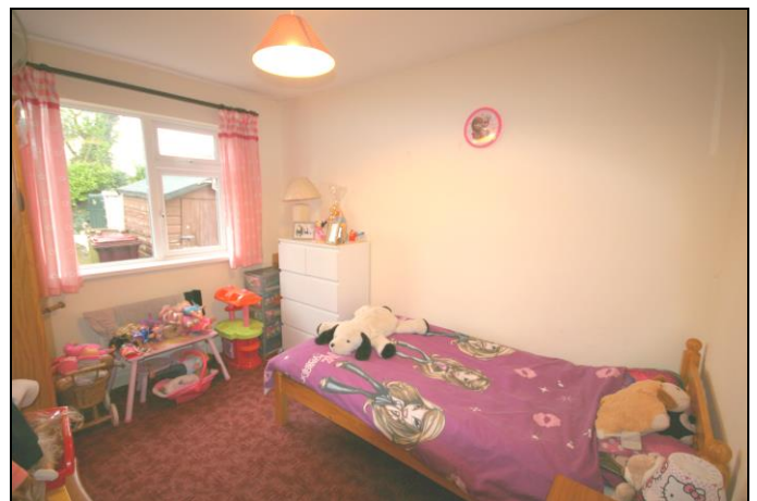
Bedrooms 2 & 3

Bathroom: 2.0(m) x 1.8 fully paneled pvc walls, electric "Mira" walk-in shower, w.c. & w.h.b.