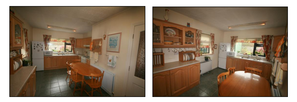
Utility Room: 2.80 x 1.20 built-in presses & sink unit, tiled floor.

Kitchen: 5.00 x 3.30 built-in units & eye level presses, tiled floor.