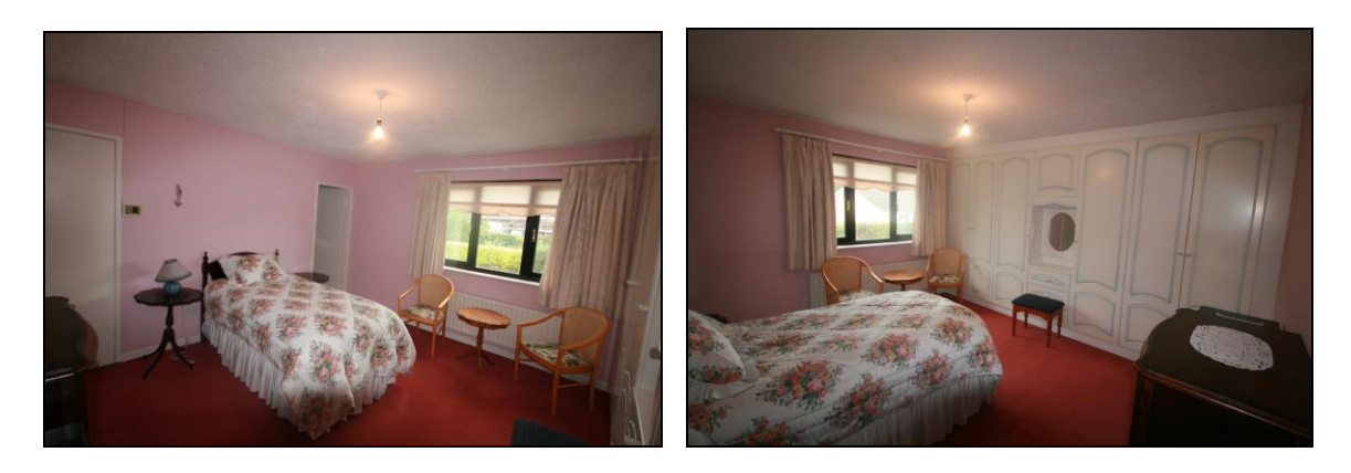
Bedroom 2: 3.60 x 3.40 with wall to wall built-in wardrobes.

Bedroom 1: 4.10 x 4.00 with wall to wall built-in wardrobes & dressing area. En-Suite: 2.10 x 1.70 tiled "Mira" shower, w.c. & w.h.b.