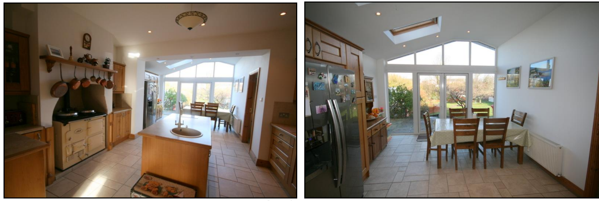
Kitchen / Dining Room

Kitchen/Dining Room : 7.736 x 4.37 tiled floor, solid built-in units & eye level presses, double sink, pumped water tap, 2 Oven Oil "Aga", integrated "Whirlpool" Dishwasher, Oven and ceramic hob, plumbed for American style fridge. French doors to the rear.