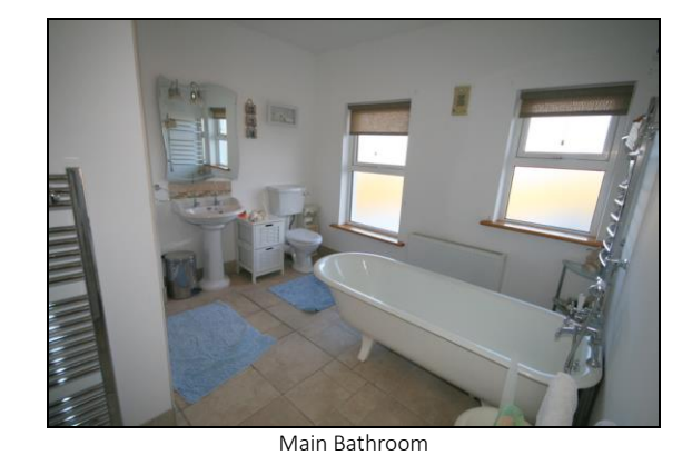
Bathroom: 3.33 x 3.17 free standing bath, large separate shower, w.c. & w.h.b.