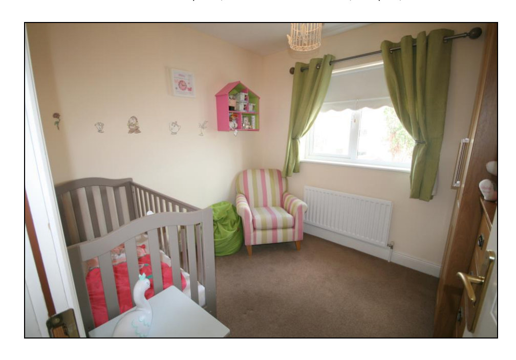
Bedroom 2 : 3.9 x 3.2 rear aspect, carpet, built-in wardrobes , t.v. point. En-Suite: 2.6 x 1.3 fully tiled floor to ceiling, w.c. & w.h.b & "Triton T90xi" electric shower.

Bedroom 1: 2.9 x 2.5 rear aspect, built-in wardrobes, carpet, blinds & curtains.