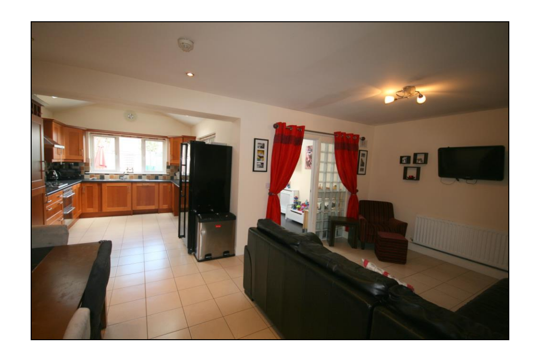
Playroom: 4.0 x 2.2 rear aspect, with laminate floor & door to rear