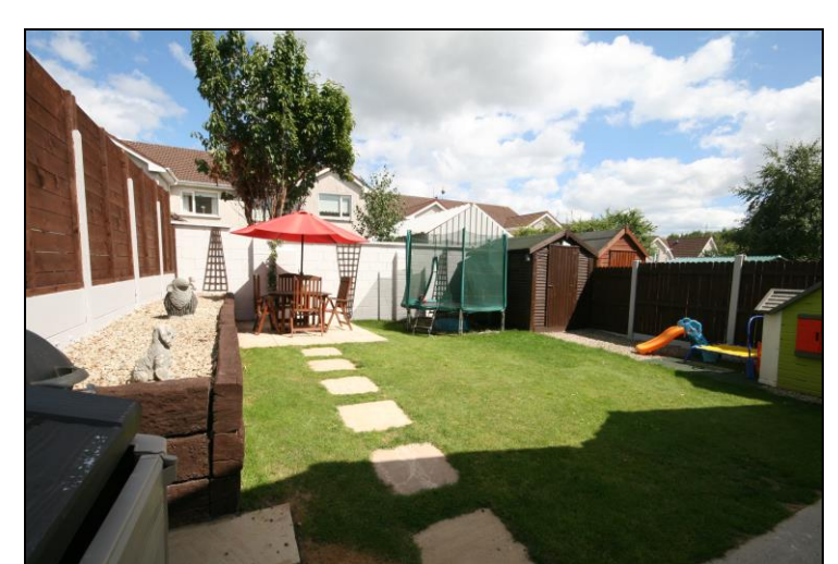
Double cobble-lock driveway to the front. Enclosed rear garden with patio area, elevated planting area & timber garden shed.