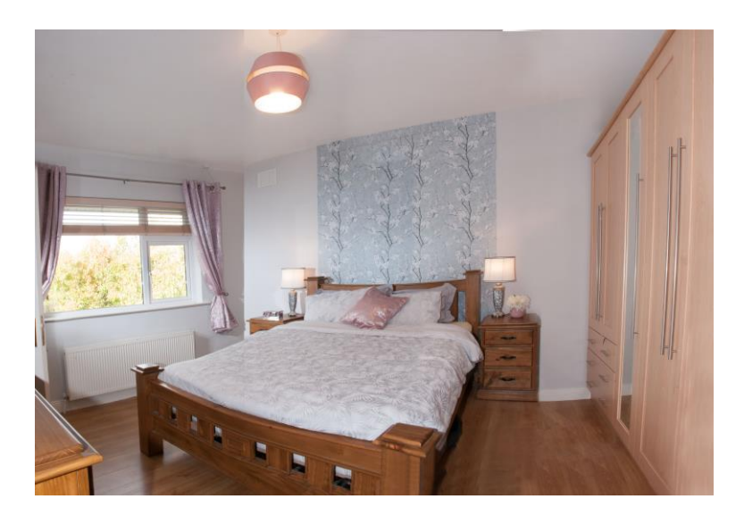
Bedroom 2: 4.2 x 3.6 double built-in wardrobes.