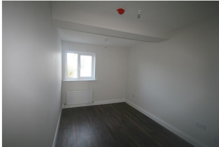
Bedroom 2: 3.5 x 2.5 rear aspect, laminate timber floor, built-in wardrobe.