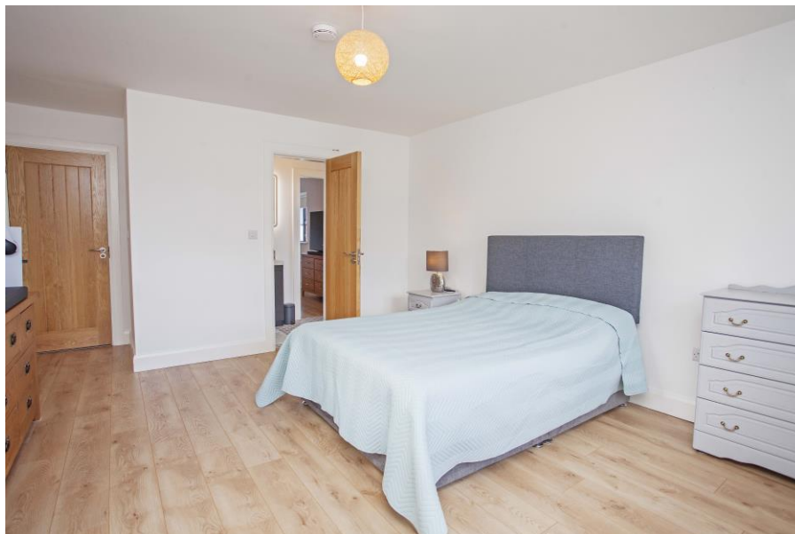
Bedroom 3: 4.4 x 4.0 with Jack & Jill Shower Room off.