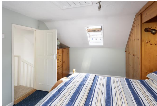
Bedroom 2: 4.4 x 2.2 Double built-in wardrobes