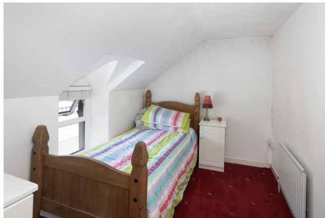
Bedroom 3: 3.0 x 2.1 built-in wardrobes