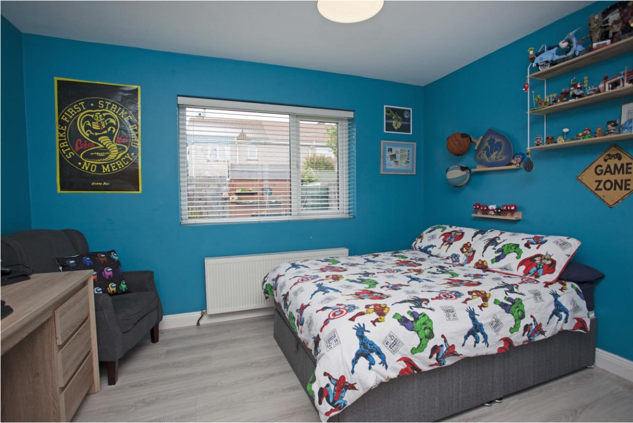
Bedroom 3: 3.5 x 3.2