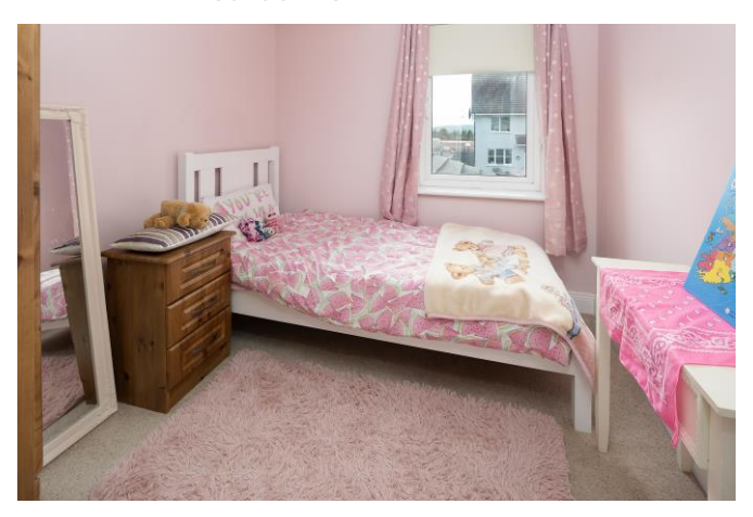
Bedroom 4: 3.2 x 2.4