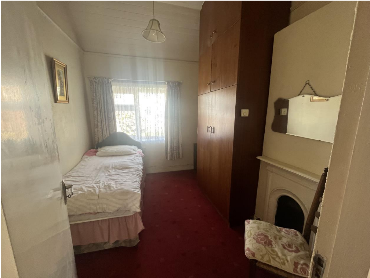
Bedroom 2: 2.6 x 2.1 front aspect