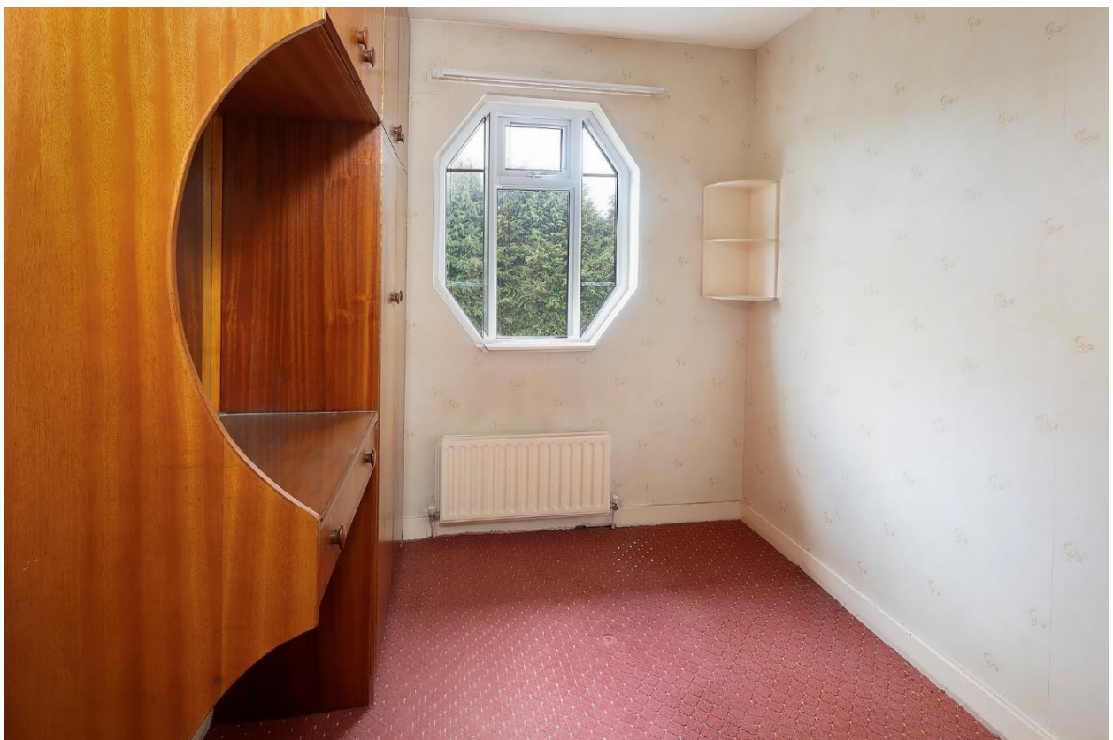
Bedroom 4: 2.9 x 2.3 built-in wardrobe.