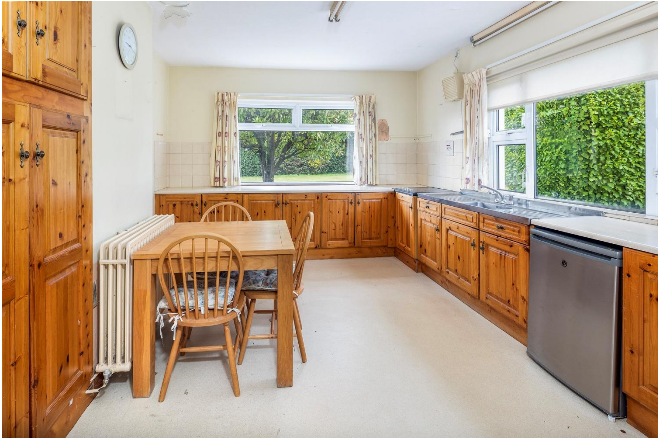
Utility Room: 3.8 x 3.4 tiled floor, built-in units, door to rear.